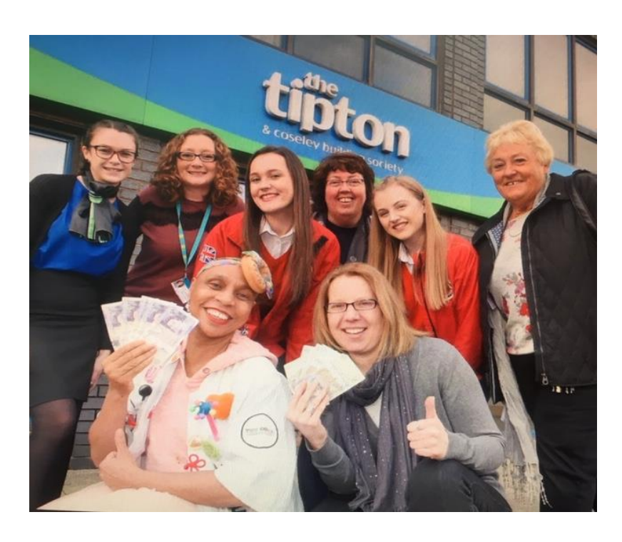
A GENEROUS DONATION OF £1000 FROM TIPTON AND COSELEY BUILDING SOCIETY