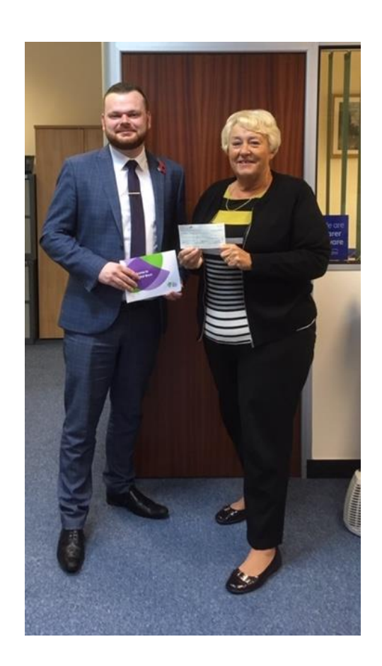
ACCEPTING A CHEQUE FOR £1000 FROM THE WEST BROMWICH BUILDING SOCIETY